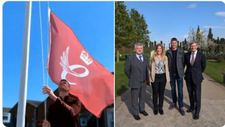
7:49 AM · Apr 21, 2023 · 1,239 Views